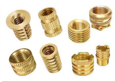
Brass Inserts - P-FIXBI