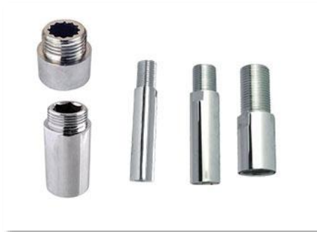
Regular CP & Brass Fittings - P-FITTFB

A large selection of chrome fittings and nipples – made of solid brass and chrome-plated for a durable yet stylish fitting. Made of solid brass, these fittings are then plated for an attractive and durable finish.