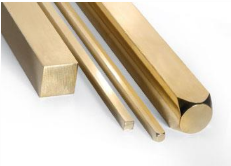
Hex/Round/Square Rods- P-ALLOYHRS