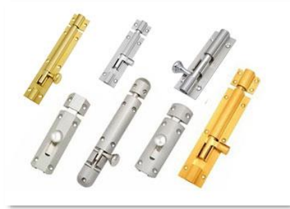
Tower bolt - P-STARKETB