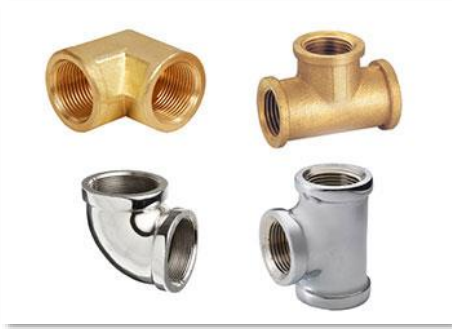
Brass & Chrome Pipe Fittings -P-FITTPF