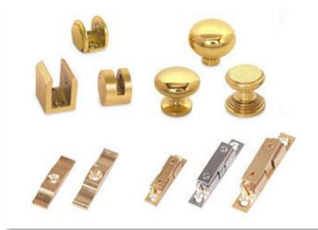
Door & window fittings - P-STARKEFD

Since our inception, we are involved into manufacturing and exporting of premium quality range of brass hardware fittings.