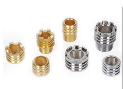
Brass Pipes Inserts - P-FIXPIPES

Products are available in metric UNC UNF BSW BA BSP ISO metric DIN threaded Brass molding inserts and roto molding. Molding inserts molding turned parts are also available as per customer design and samples plastic moulding PVC injection moulding rubber moulding. We are largest manufacturer exporters suppliers of Brass moulding insert from INDIA