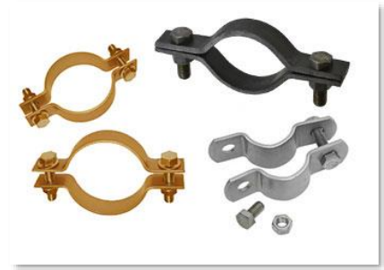
Pipe Clamps - P-FITTPC