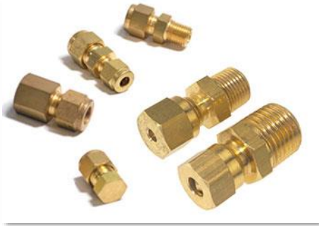
Brass Compression Fittings - P-MAXCF