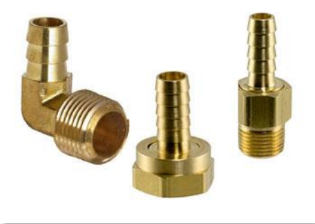
Brass Hose Fittings - P-MAXHF