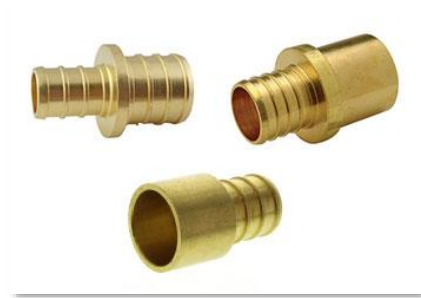
Brass Pex Fittings - P-MAXPF