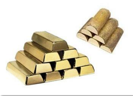
Brass Ingots- P-ALLOYBI