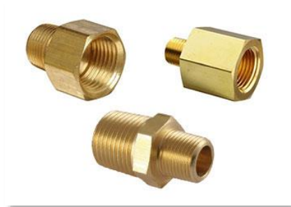
Brass Adaptors - P-FIXBA