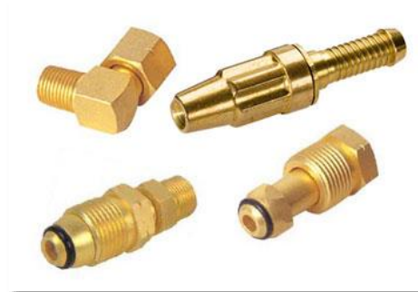
Brass Gas Fittings - P-MAXGF

We offer high quality Brass Compression Fitting that is made from high grade brass. The Industrial Brass Tube Fitting, manufactured by us, is ideally used in Process Instrumentation. Our Brass Compression Fitting is highly durable, rust-resistant and requires no maintenance. It is available in various sizes and specifications in order to meet the requirements of the clients.