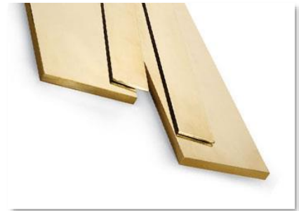
Brass Bars- P-ALLOYBBR